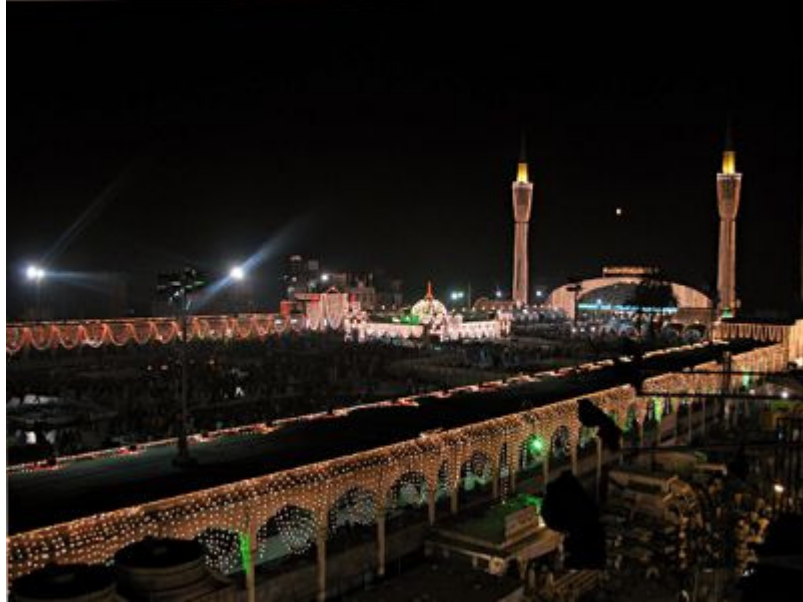
Daata Darbar complex illuminated at night during the annual Urs Sharif Celebrations

Hujwiri Chair” in honour of his teachings and works. There is a Sayyid Ali Hujwiri University and there are plans for a hospital.